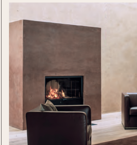
At Vigilius Mountain Resort, in South Tyrol, Thun beautifully united muted browns and dark tones with a world of box-shaped elements.

2015 Red Dot Award for Axent “One” 2014 Good Design Award for Antrax “Serie T” radiator shelves and towel rails 2010 Green Good Design Award for Rapsel “Ofurò” bathtub; Belux “Arba” lighting; Biomass Power Station, Schwendi 2010 Wallpaper* Design Award for TVS “Terra” cookware 2006 Red Dot Award for Porsche Design Store 2004 Compasso d'Oro award for Catalano “Girly System”